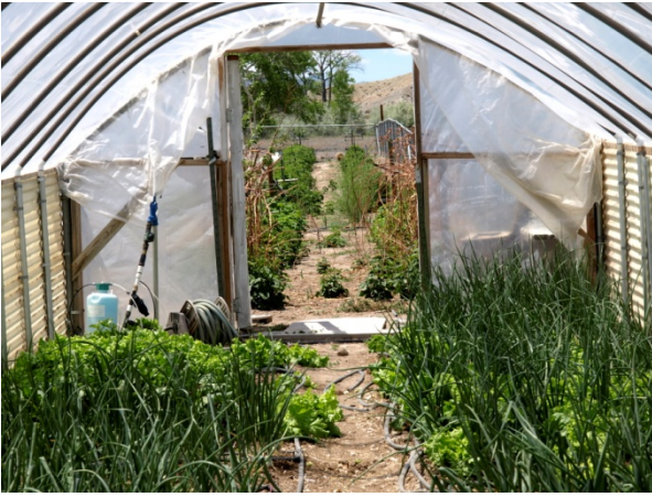
Figure 7. 54mm normal-angle view. Not as much of the view inside the greenhouse can be seen.