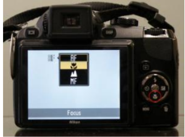
Figure 9. The macro mode setting that allows the camera to produce close-up shots.

symbol (Figure 9) and a mountain indicates settings for infinity or long-range shots.