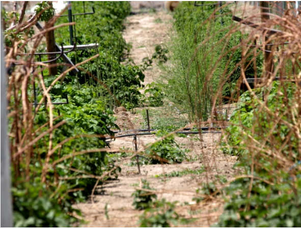
Figure 8. 200mm telephoto view This shot is clear through the end of the greenhouse door.