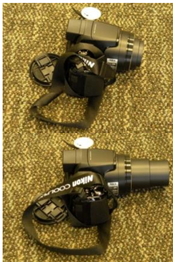
Figures 1 & 2. Figure 1 shows this camera at its minimum focal length of 4.7mm, while Figure 2 shows the 110mm maximum focal length.

the picture, such as wide angle, normal angle and telescopic view.